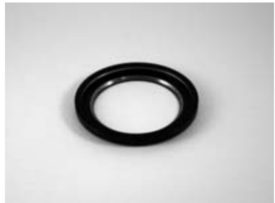
Dark Field Reflector (LP-DFR, 010090460000)